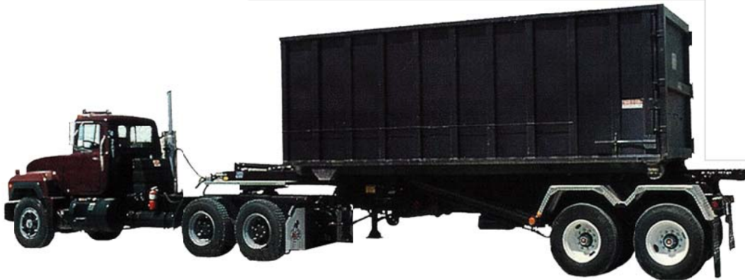
Retracted to 32 feet

All EXT Trailers come with a Front Trolley Cylinder. This allows the container to move back and forth to adjust the weight of the load